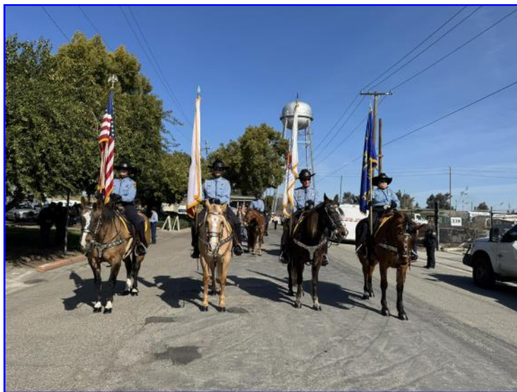
Alameda County Sheriff's Office Mounted Posse