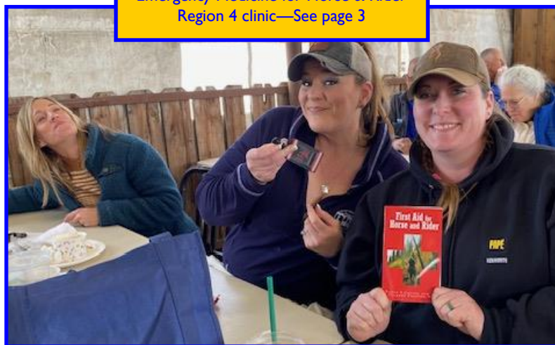
"Emergency Medicine for Horse & Rider" Region 4 clinic—See page 3