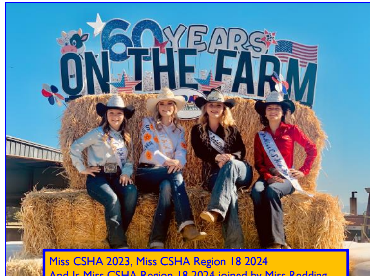
Miss CSHA 2023, Miss CSHA Region 18 2024 And Jr Miss CSHA Region 18 2024 joined by Miss Redding Rodeo, volunteered at a local Raw milk dairy at their 60 year Milk & Cookies Celebration

The region 18 2024 royalty ladies started their reign in August of 2023. Some of the fun events the ladies have participated in so far include their first Jr Rodeo Grand Entry at the Red Bluff Jr Round Up, and grand entry at the Redding Rancheria Stillwater Pow Wow. Volunteer events like the Hawes Ranch customer appreciation day, raw milk and cookies farm day. Showing support and competing at multiple gymkhanas and western pleasure shows. Not only are they sash sisters inside the arena but outside as well. The girls like to have monthly arena days and go to clinics together, they also cheer each other on at their school sporting events. They believe in supporting one another and their fellow local PRCA & CCPRA sash sisters, and love going to support these other ladies at their competitions and coronations. Recently they helped welcome in the new Miss Redding Rodeo. We have so many more fun events planned! Follow the ladies journey on our Facebook page http://www.facebook.com/csharegion18royalty-program .