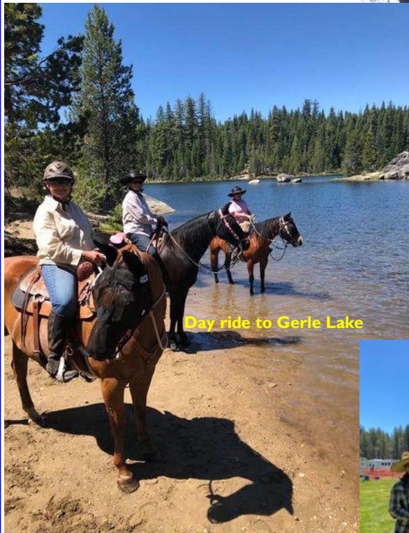
Day ride to Gerle Lake