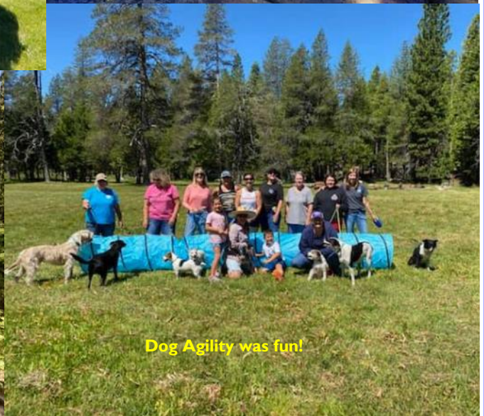
Dog Agility was fun!