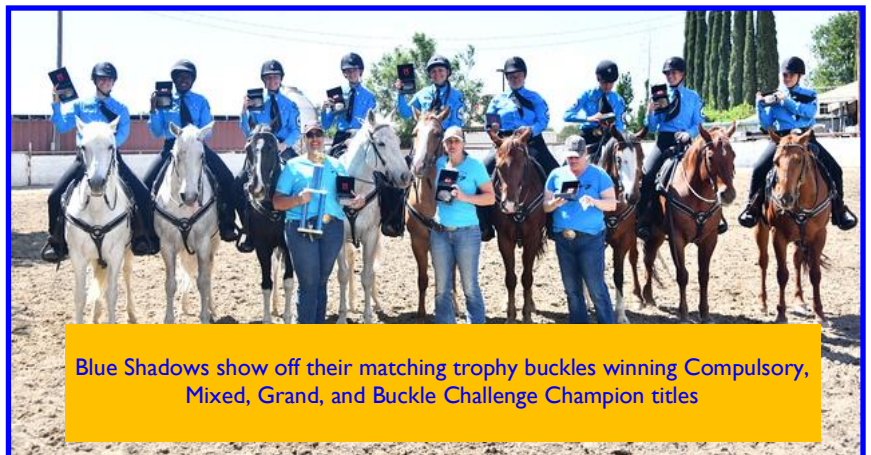
Blue Shadows show off their matching trophy buckles winning Compulsory, Mixed, Grand, and Buckle Challenge Champion titles