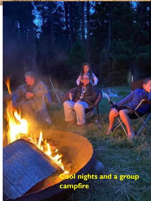
Cool nights and a group campfire