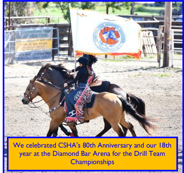
We celebrated CSHA's 80th Anniversary and our 18th year at the Diamond Bar Arena for the Drill Team Championships