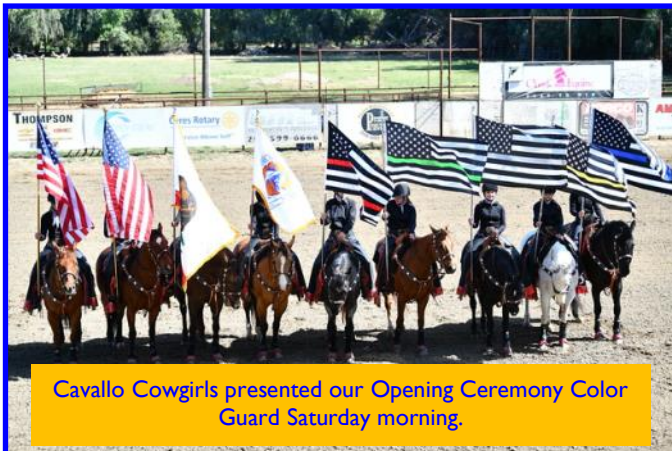
Cavallo Cowgirls presented our Opening Ceremony Color Guard Saturday morning.