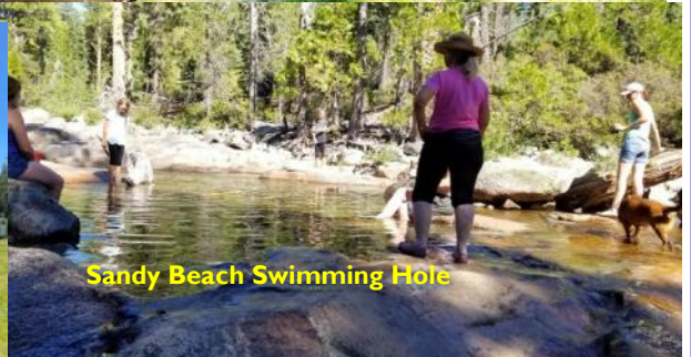
Sandy Beach Swimming Hole