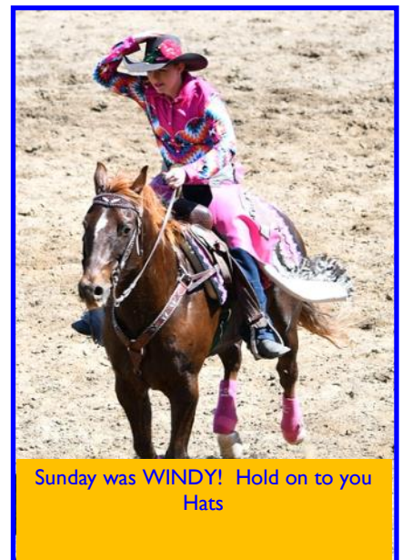
Sunday was WINDY! Hold on to you Hats

Sunday was a " Hold onto your Hat " kind of day. In fact it was so windy we made the decision to not ride with any flags for the day after our National Anthem with the colors presented by the Blue Shadows . Our