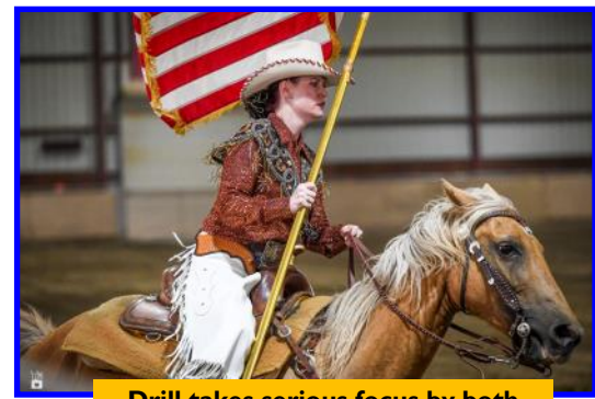
Drill takes serious focus by both horse & rider

With two competitions of awards to give out, everyone went out with their hands full. Congratulations to all of the teams for a spectacular event at a new facility! It dawned on me when we arrived and I saw the Tribal flag hanging on the wall to the right of the American flag, which looked very unusual, that we were on Tribal land, and in a sovereign nation, that this was our first international competition!