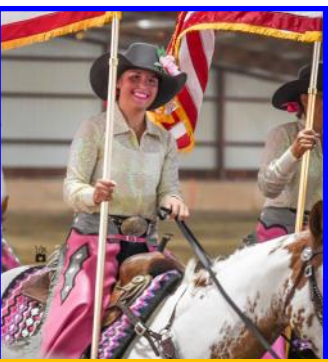
Flying Fillies always win the biggest Smile award!