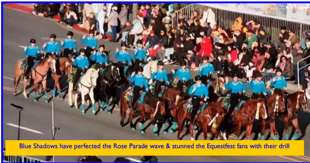
Blue Shadows have perfected the Rose Parade wave & stunned the Equestfest fans with their drill