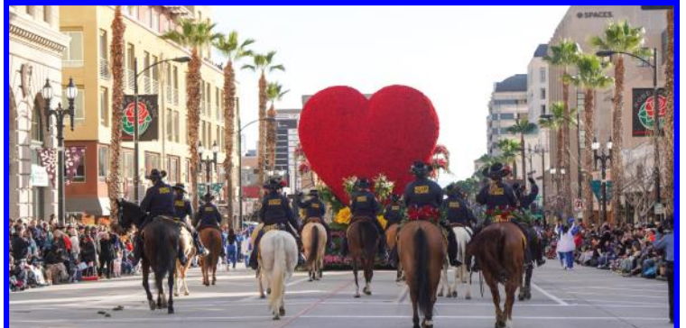
Alameda County Sheriff Posse head down Colorado Blvd January 2nd

Whether we participate as the only equestrian in a hometown parade, are selected to represent California in a Presidential Inaugural Parade or receive an invitation to ride in the historic Rose Parade in Pasadena we all expose our horsemanship and our special horses in a most positive way. As we begin a new year, I want to thank you for your membership and support. I am looking forward to seeing all of you in Ripon this month.