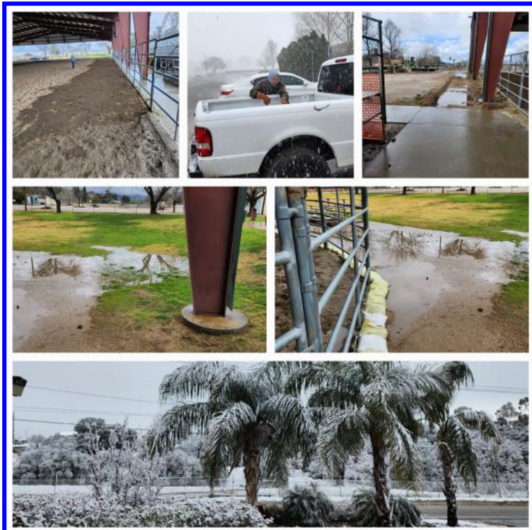
Arena Clean-up crew. Who says it doesn't snow in So. CA?