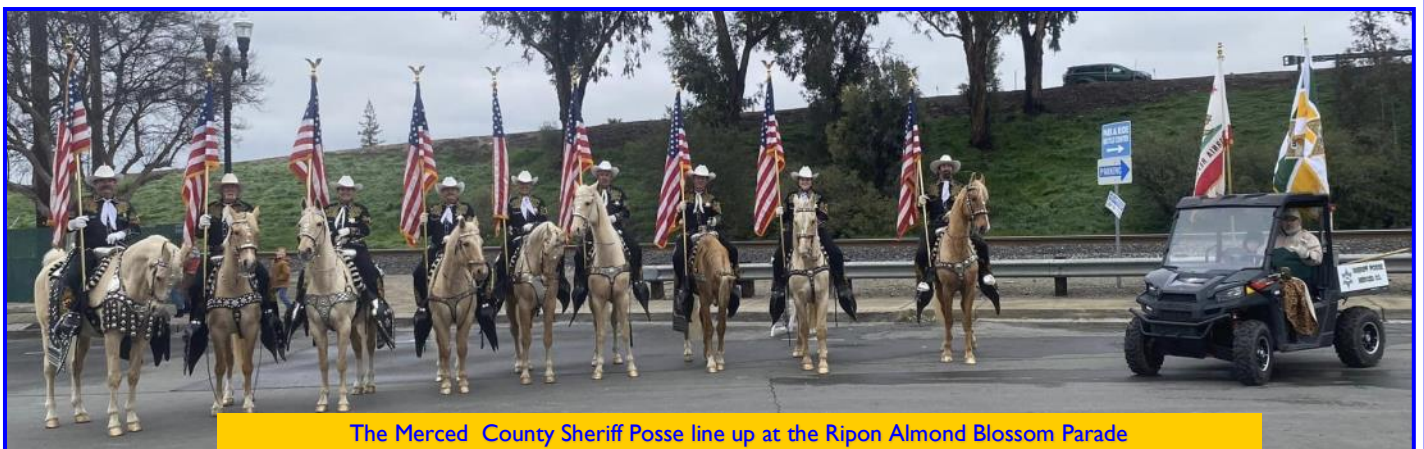
The Merced County Sheriff Posse line up at the Ripon Almond Blossom Parade