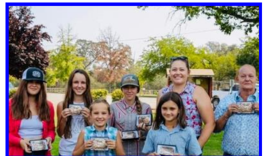
CSHA Region 3 Gymkhana Series 2022 Buckle Winners!